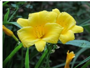
This is also the perfect opportunity to admire all the beautiful yards in our neighborhood.